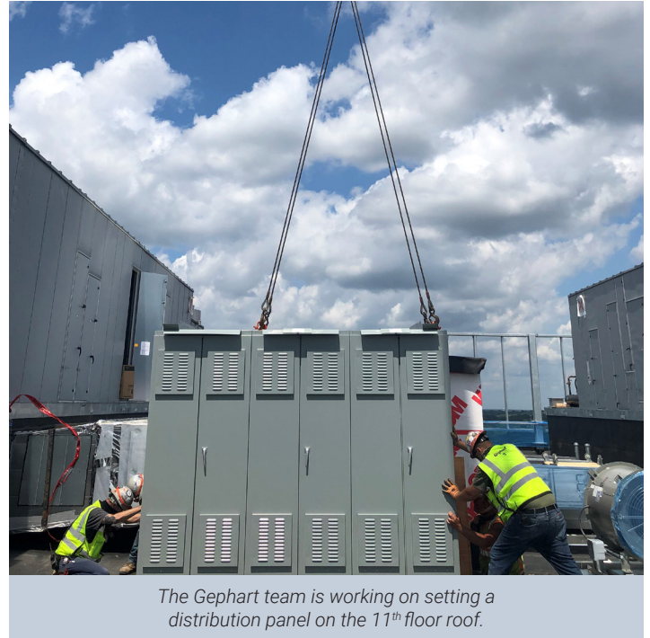
The Gephart team is working on setting a distribution panel on the 11 th floor roof.

10 West End will be completed by the end of December.